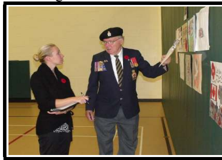
Poster contest judges