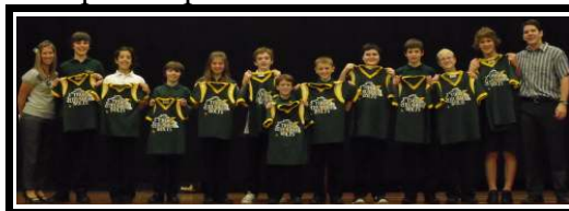
Thor Thunderbolts Volleyball Team

Due to the hard work and commitment of the team we played some amazing volleyball throughout the season and placed third in the northern division, progressing to the SSAF championship finals.