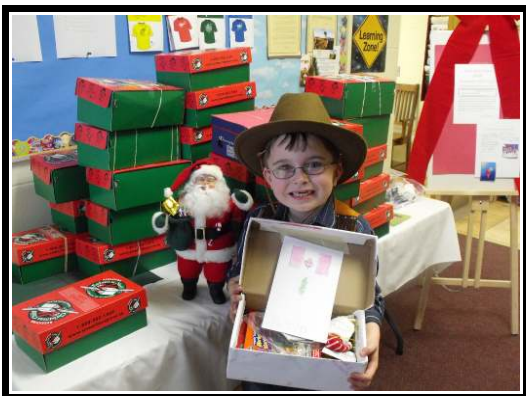
Operation Christmas Child-Shoeboxes