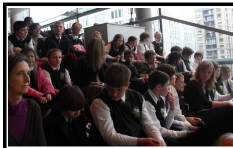
At the Toronto Opera Company

Overall, the day was an informative, interesting and cultural day which helped students to reflect upon their own understanding and appreciation of art. We were fortunate to partake in this day, and hope to have a trip like this again in the future.